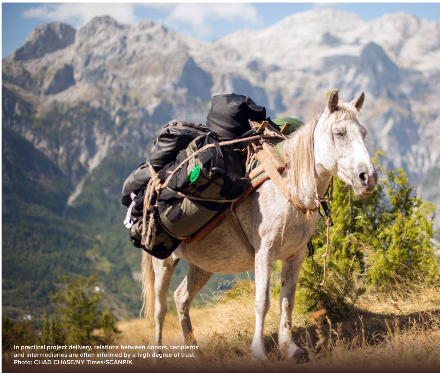
In practical project delivery, relations between donors, recipients and intermediaries are often informed by a high degree of trust.

organisation is expected to operate. It has proved difficult to get away from the previously criticised New Public Management approach, a difficulty attributable to the challenges that exist in development assistance when it comes to interpersonal trust. The distance between recipient and donor, and constant turnover of staff in donor agencies, can make it harder both to establish and to maintain personal relations.