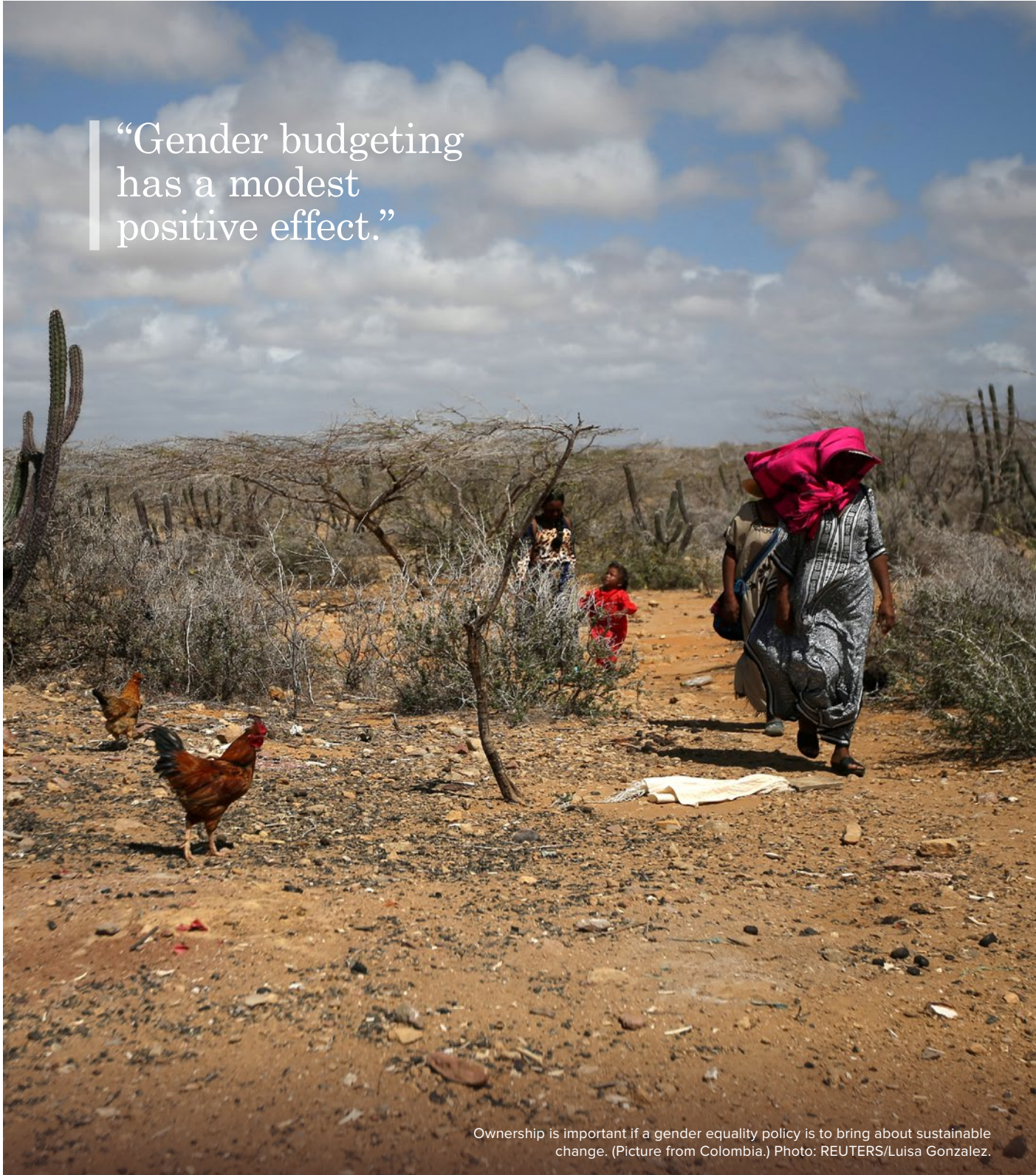
Ownership is important if a gender equality policy is to bring about sustainable change. (Picture from Colombia.)

“Gender budgeting has a modest positive effect.”