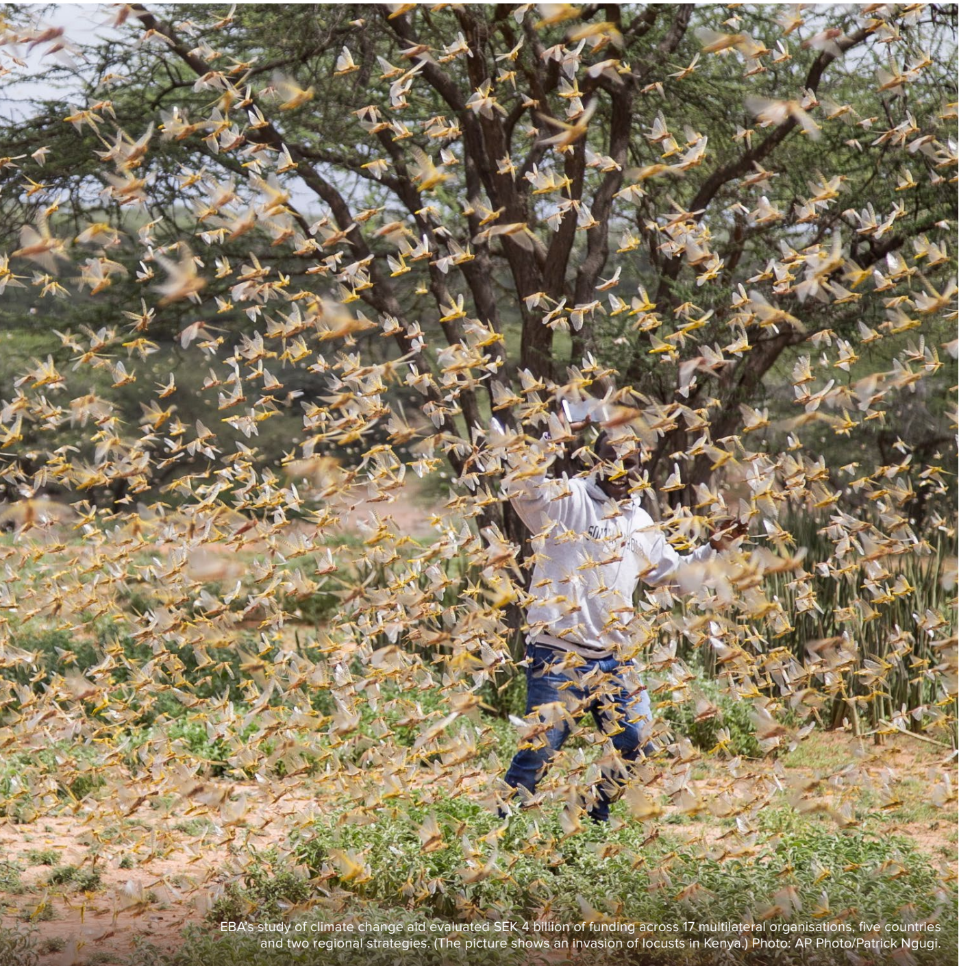
EBA's study of climate change aid evaluated SEK 4 billion of funding across 17 multilateral organisations, five countries and two regional strategies. (The picture shows an invasion of locusts in Kenya.)

“The Swedish Climate Change Initiative 2009–2012 achieved sustainable results.”