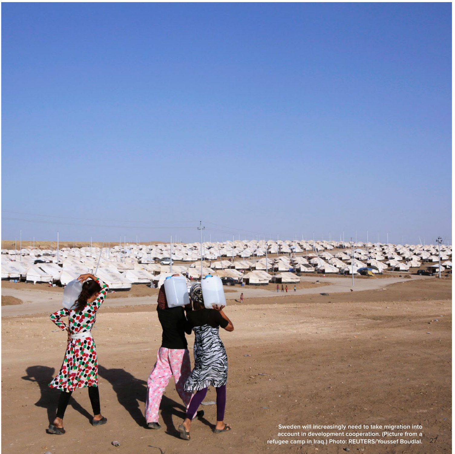
Sweden will increasingly need to take migration into account in development cooperation. (Picture from a refugee camp in Iraq.)

“The links between migration and development are complex.”