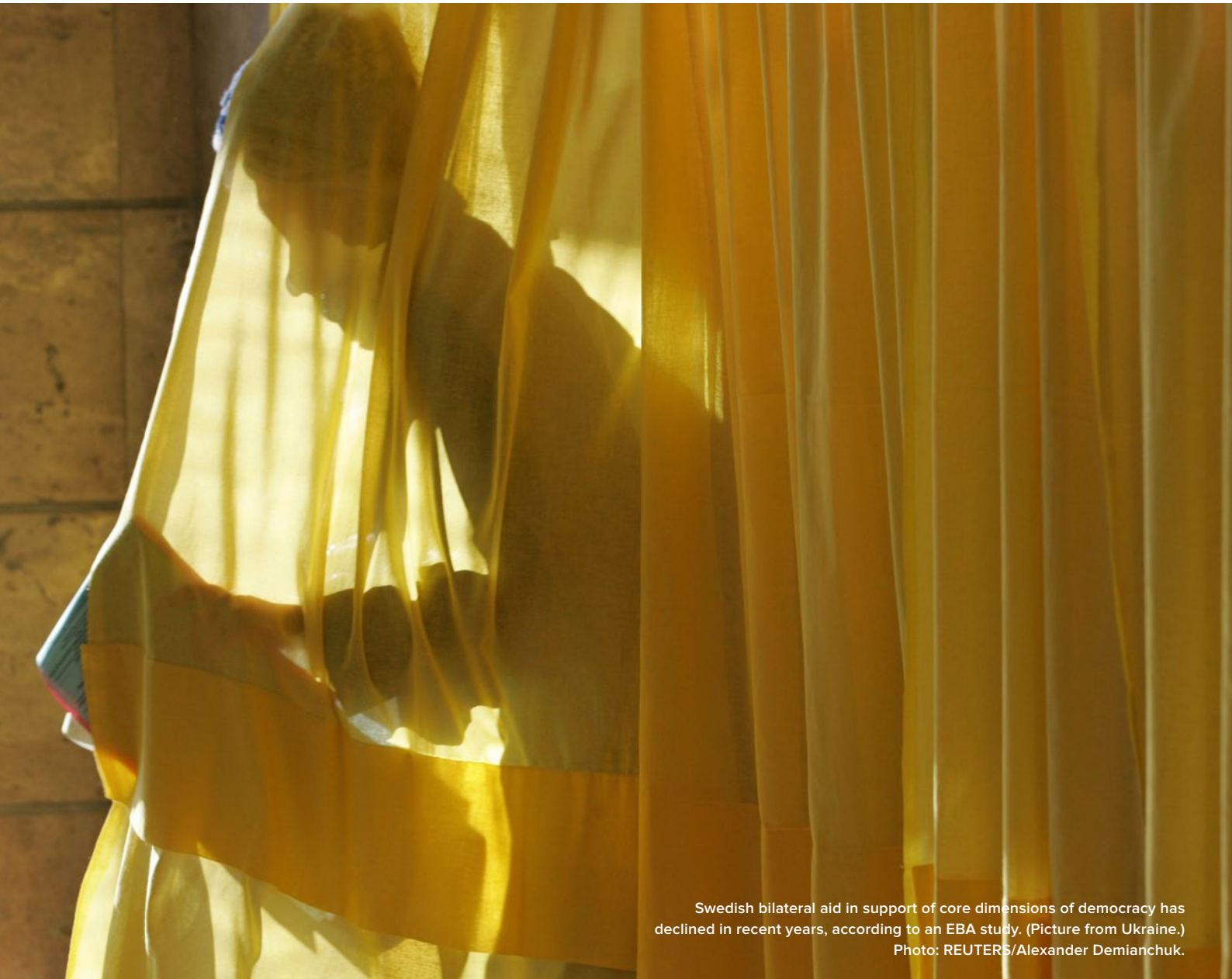
Swedish bilateral aid in support of core dimensions of democracy has declined in recent years, according to an EBA study. (Picture from Ukraine.)

Swedish bilateral democracy aid aimed at core dimensions and linked to specific countries – precisely the kind of assistance which the empirical findings suggest produces the greatest benefits.