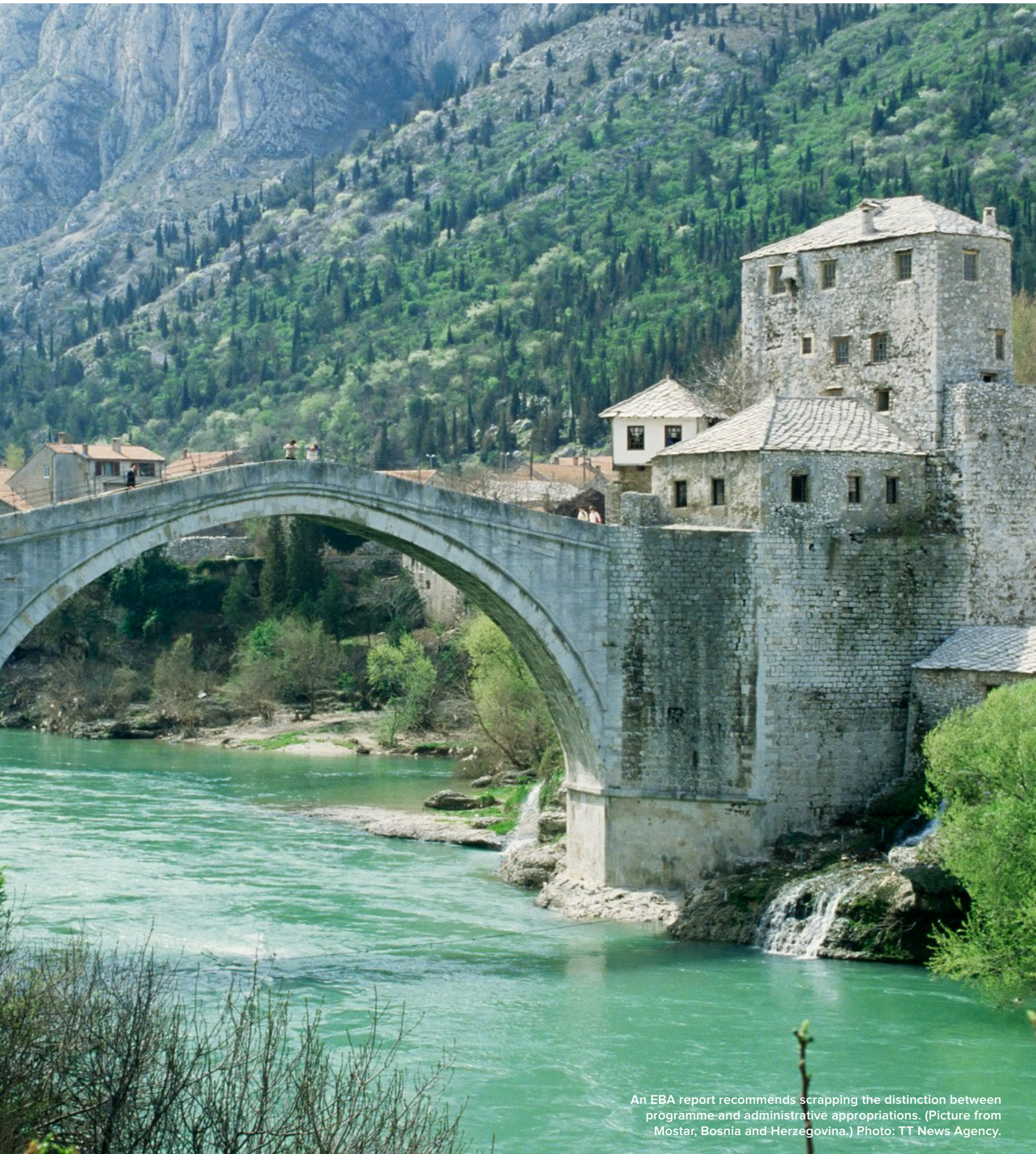
An EBA report recommends scrapping the distinction between programme and administrative appropriations. (Picture from Mostar, Bosnia and Herzegovina.)