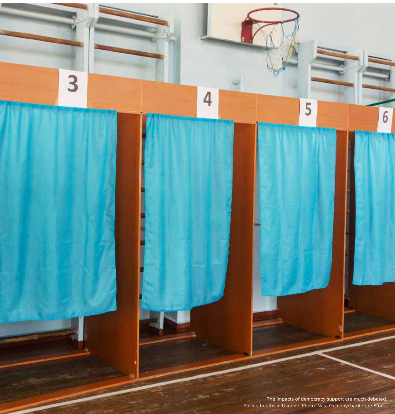
The impacts of democracy support are much debated. Polling booths in Ukraine.