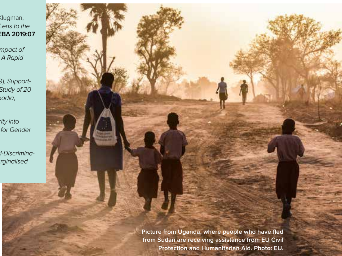
Picture from Uganda, where people who have fled from Sudan are receiving assistance from EU Civil Protection and Humanitarian Aid.