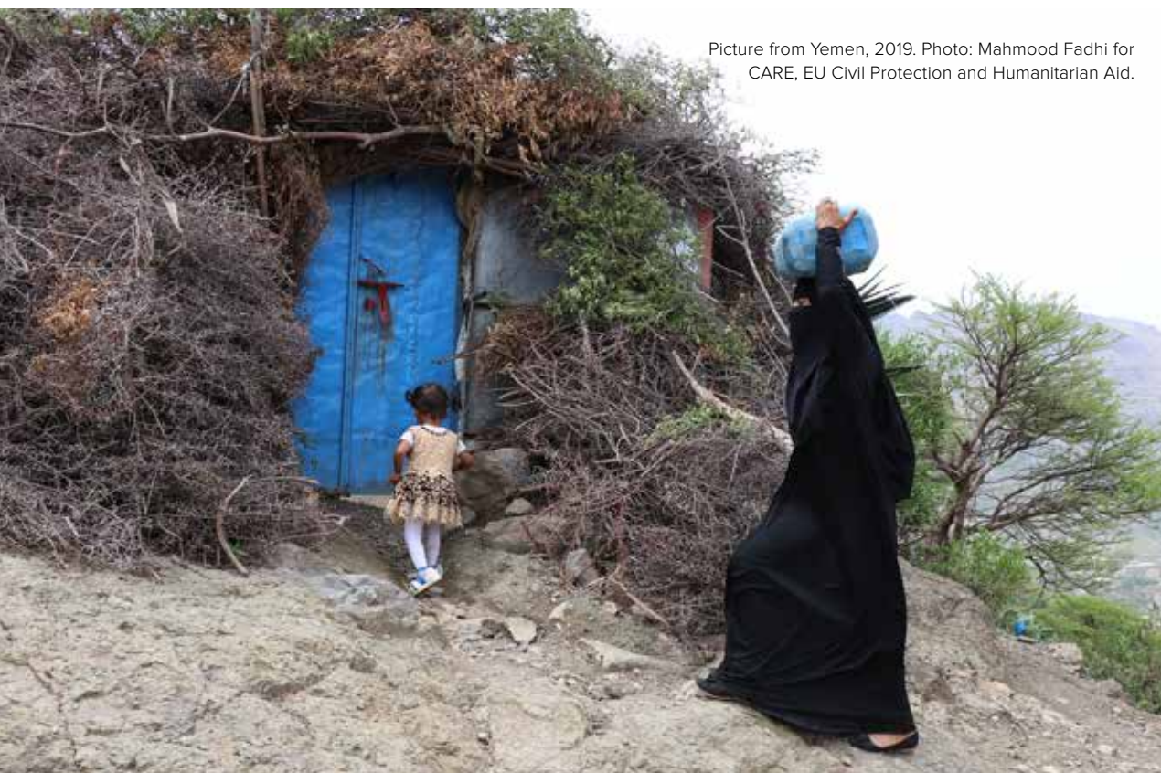
Picture from Yemen, 2019.

by trust, learning and partnership ( EBA DDB 2018:02 ). Development assistance has particular challenges at particular times, and the current focus on fragile environments, conflict and humanitarian situations may entail greater risk-taking in all three of the risk categories mentioned here.