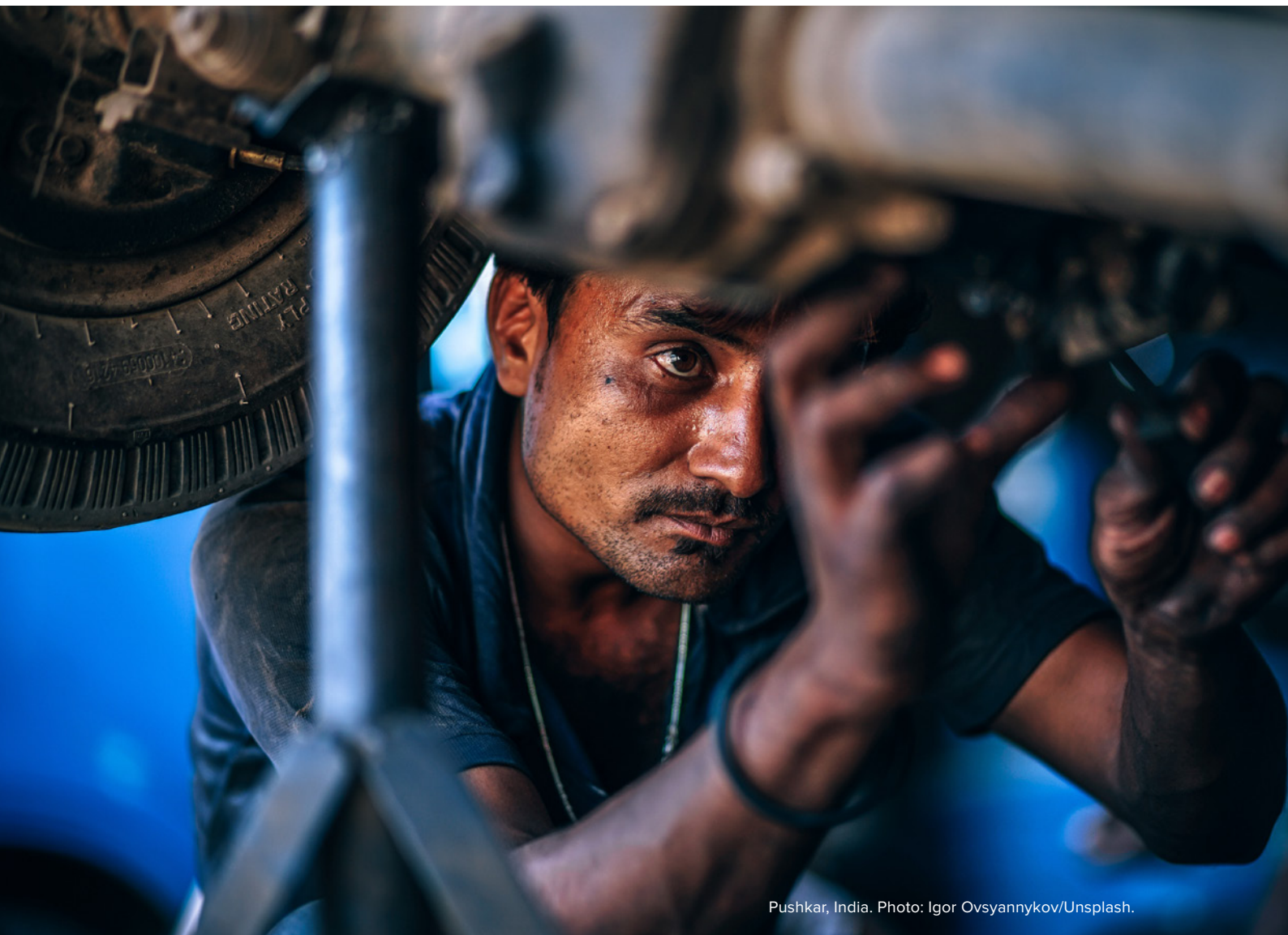
Pushkar, India.

multilateral support, with the focus on forms of financing. Earmarked support to multilateral organisations is often accompanied by special conditions, which increases transaction costs in the implementation process. Despite donors' formal agreement on what constitutes effective aid, the share of earmarked support to UN funds and programmes increased from 57 per cent to almost 80 per cent during the period 2008–2016. Sweden's multi-bilateral support has also increased since these agreements were reached in the mid-2000s – particularly during the period 2005–2010 when its share in Sida's total appropriation increased from 20 to 38 per cent.