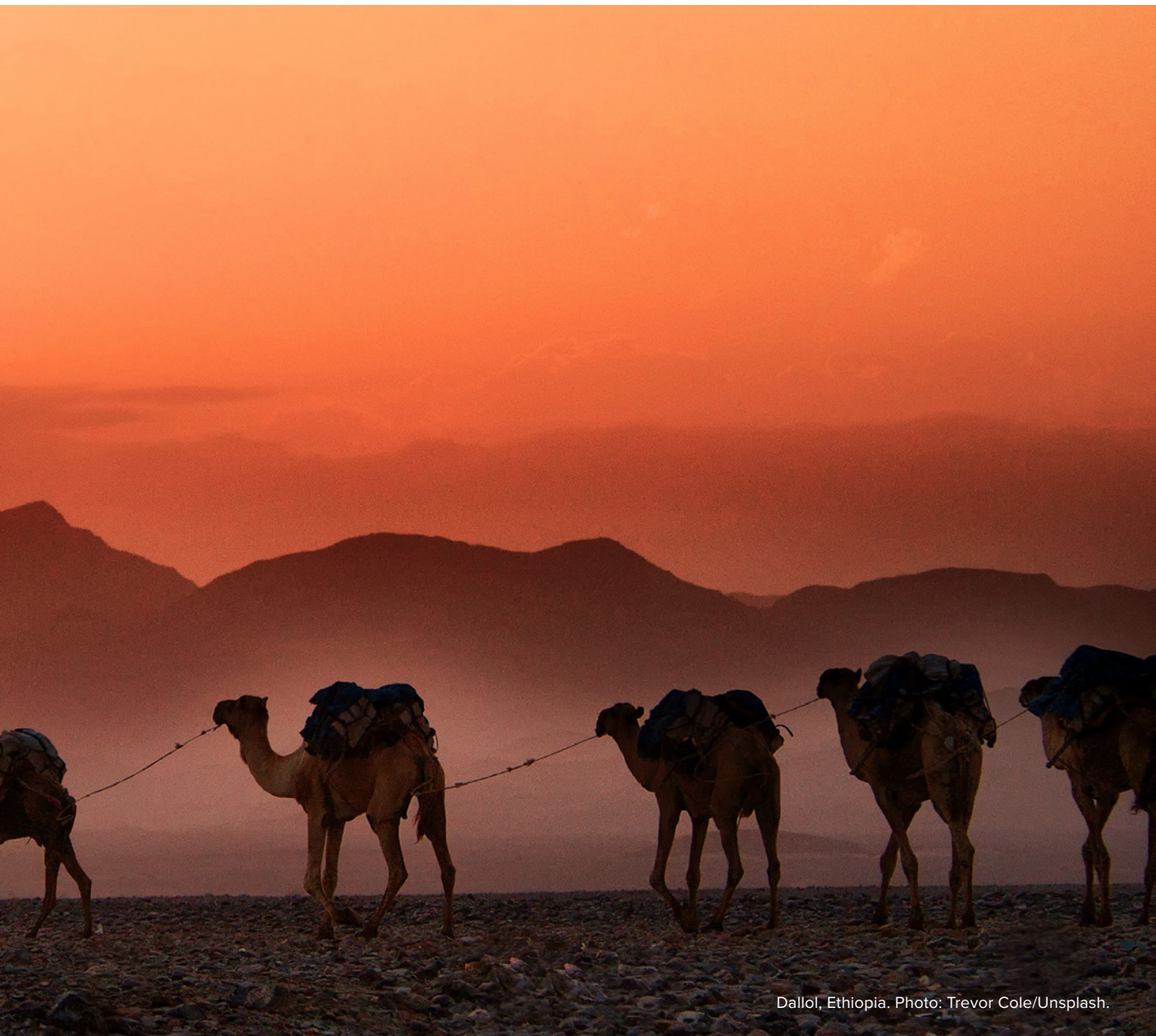
Dallol, Ethiopia.

internal EBA seminar held at Sida, the perception that evaluations seldom if ever represent a principal source of learning was confirmed. Lack of time but also a lack of relevance in evaluations appeared to be the main reasons for this.