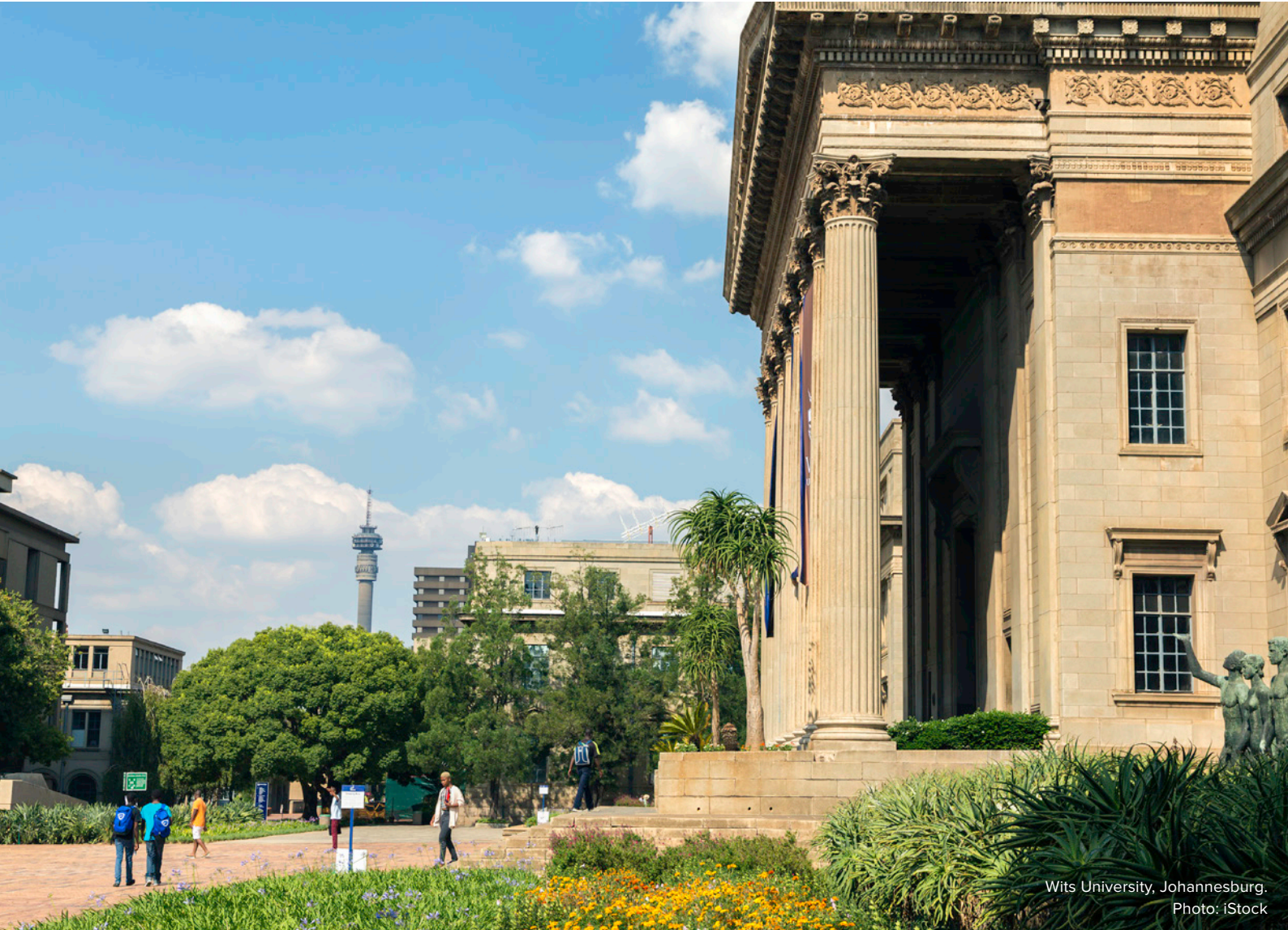
Wits University, Johannesburg.