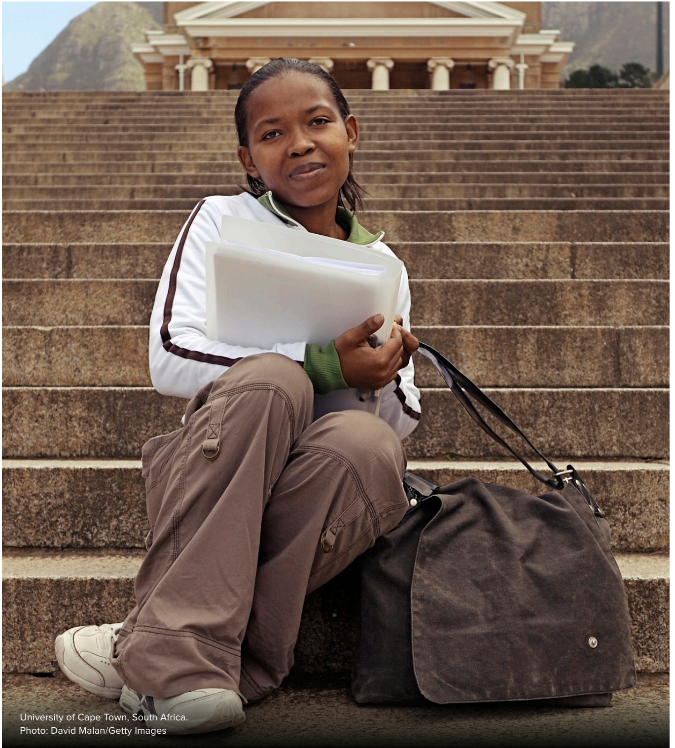
University of Cape Town, South Africa.