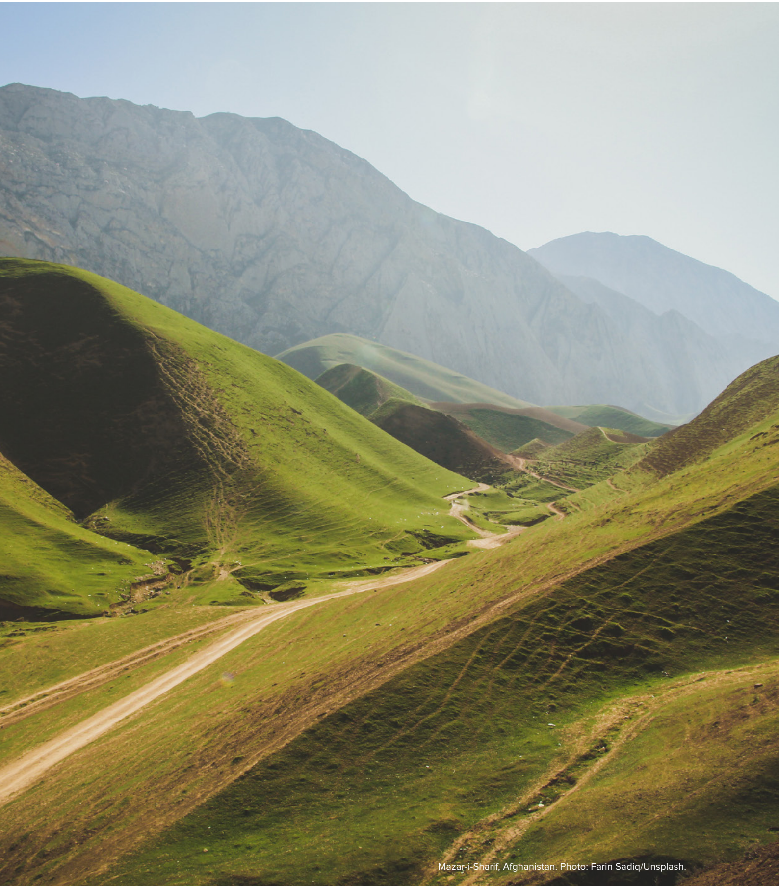
Mazar-i-Sharif, Afghanistan.