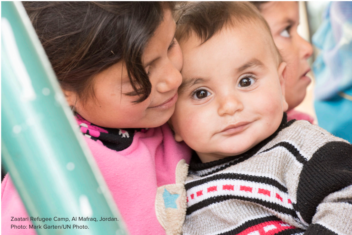
Zaatari Refugee Camp, Al Mafraq, Jordan.

prolonged, such capacity must be enhanced hand-in-hand with crisis management. Thus there will be an increasing need for a long-term approach in humanitarian aid, e.g. via efforts to combat the development of parallel structures.