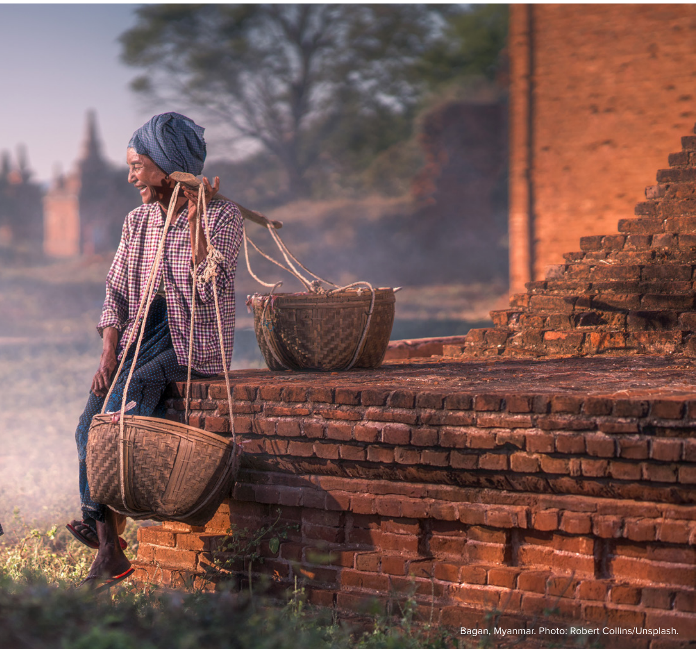
Bagan, Myanmar.

management, learning and adaptive working procedures in order to support small-scale but challenging peace processes at local level