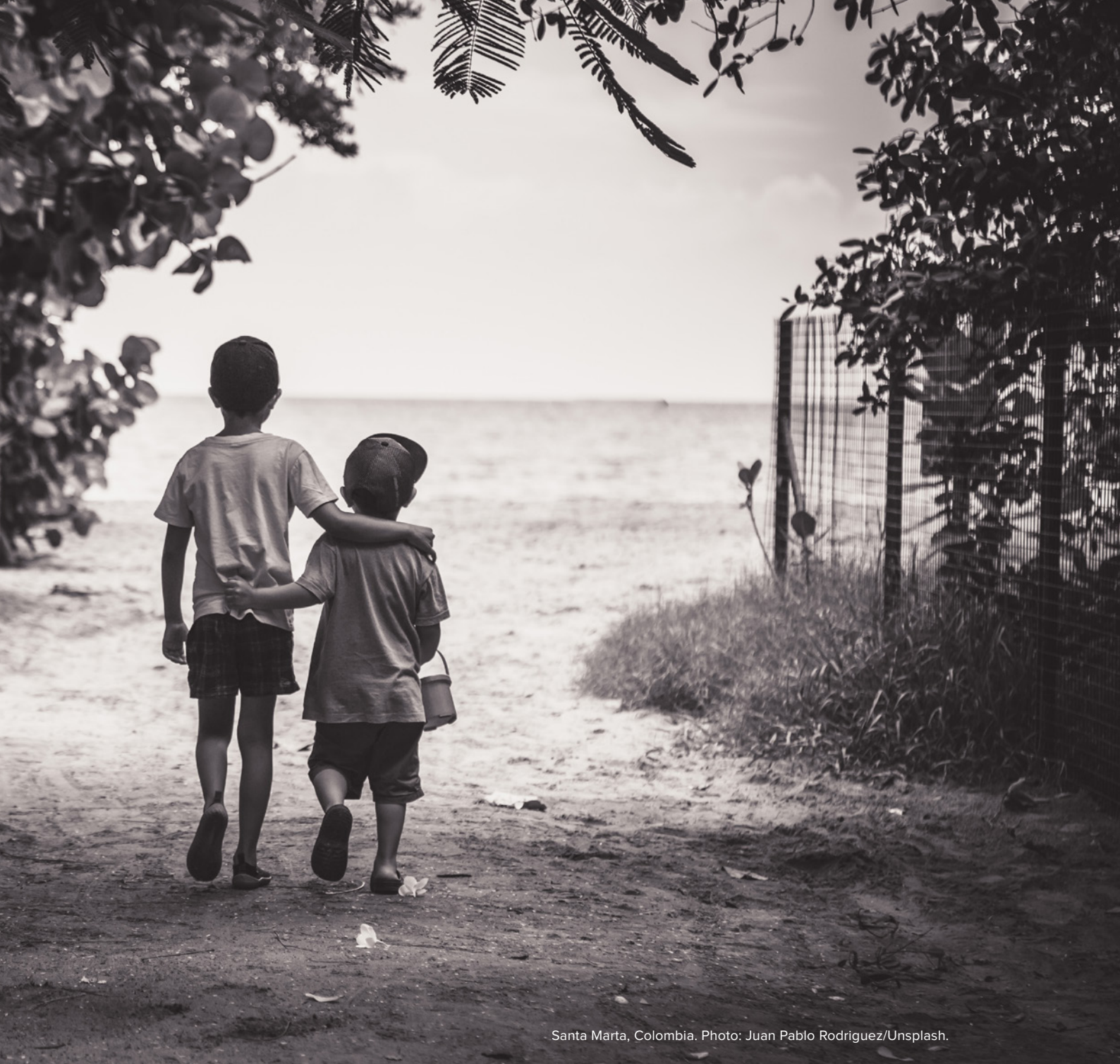
Santa Marta, Colombia.

work as a whole, and particularly in relation to SRHR. An EBA report currently being prepared is studying how men can be involved more closely in the task of promoting gender equality in the social protection field.