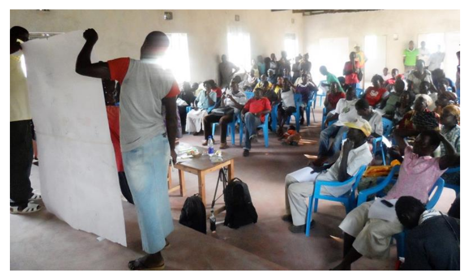
Image 4: Residents presenting a stakeholder-map during the first workshop in Dunga.