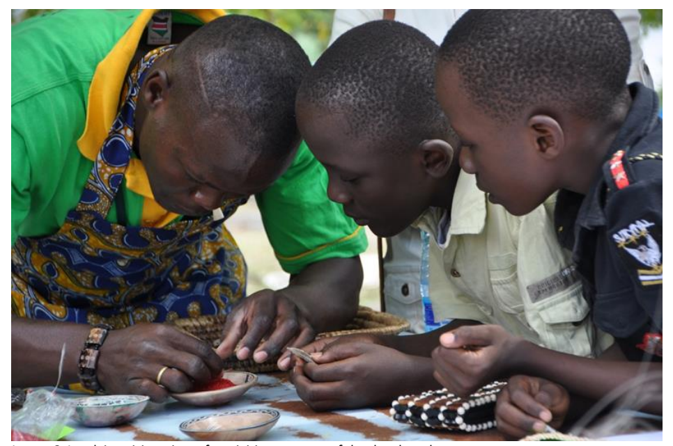
Image 6: Involving visitors in craft activities was part of the developed tours.