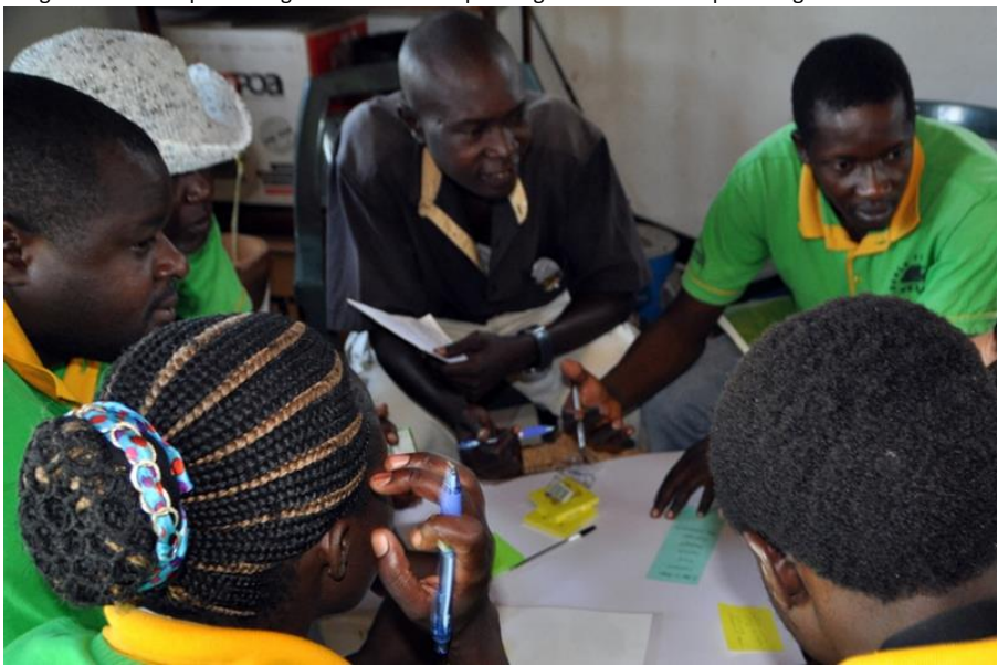
Image 5: Members of the tour guide group in Dunga discussing the development of the guided tours.