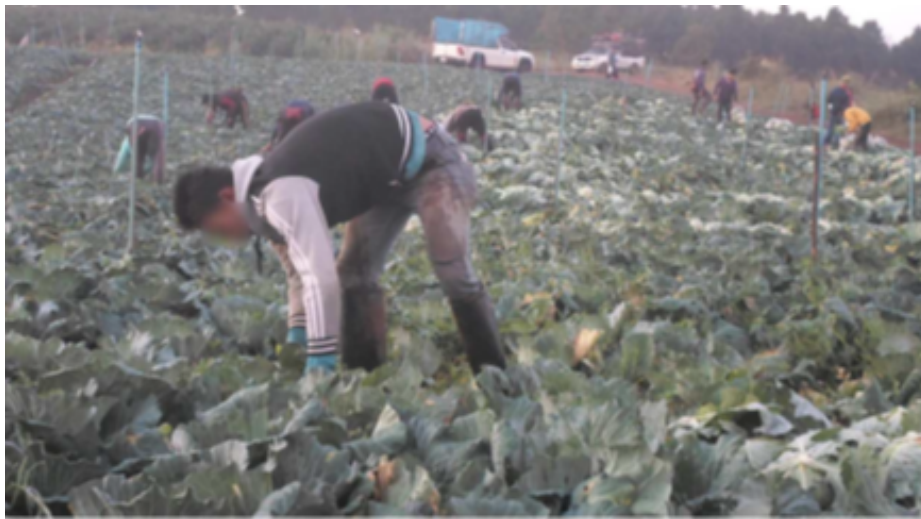
Figure 5. "Workplace"